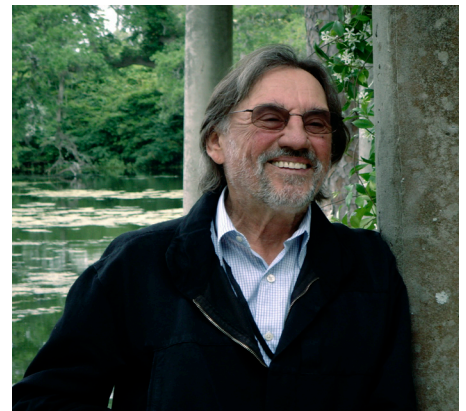
Scenes from NO SUBTITLES NECESSARY: Laszlo & Vilmos, coming to Independent Lens November 2009.