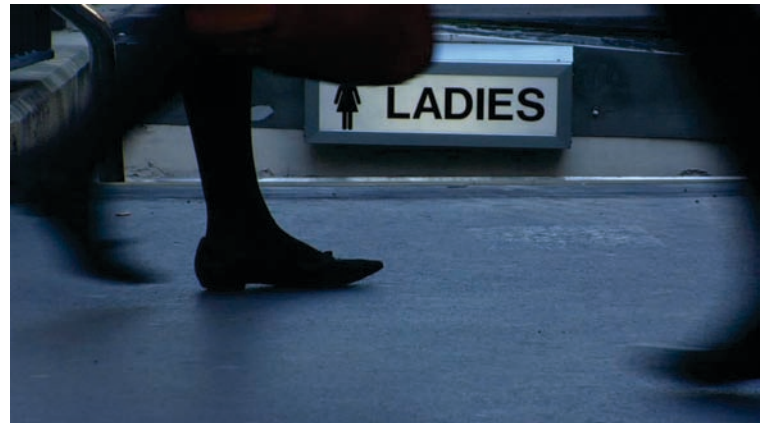
A scene from HELVETICA shot in London.

ITVS COMMUNITY is the national community engagement program of the Independent Television Service. ITVS COMMUNITY works to leverage the unique and timely content of the Emmy® Award-winning PBS series Independent Lens to build stronger connections among leading organizations, local communities and public television stations around key social issues and create more opportunities for civic engagement and positive social change. To find out more about ITVS COMMUNITY, visit www.pbs.org/independentlens/communitycinema .