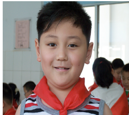
From left to right, scenes from WORDPLAY , MISS NAVAJO and PLEASE VOTE FOR ME coming to the 2007-2008 season of Independent Lens .